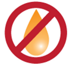
No Oil Required