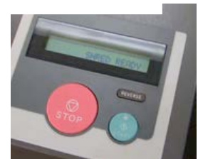
LCD Control Panel