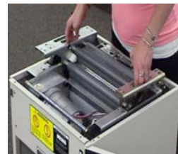
Simple Cutting Head Replacement